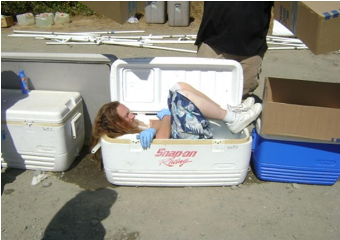
If you're going to swim in an igloo, don't forget to bring a towel!(Ian Sharp)