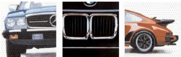
Hubbard's German Auto, Inc

236 West Grant, Eureka, CA 95501 · 707 443-4496